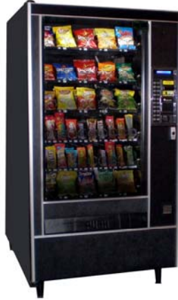
Traditional Fluorescent Lighting