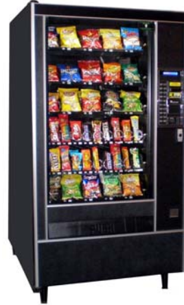
NEW VE LED Lighting System